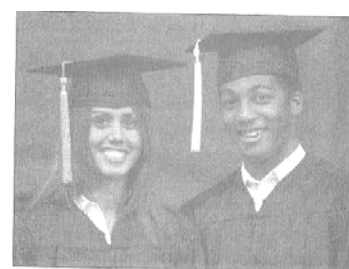
Correct position of mortarboard.