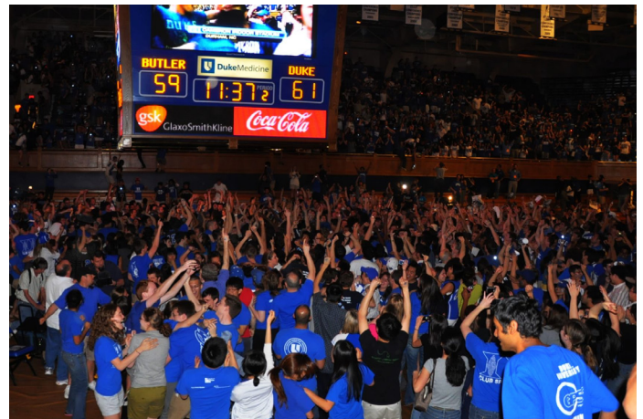
LLMs join thousands of Duke students to watch the national championship game in Cameron Stadium.