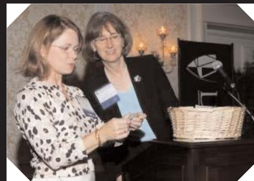
Raffling Rolling Stones tickets in support of the Annual Fund