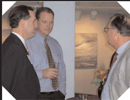
Thursday Night Welcome Reception